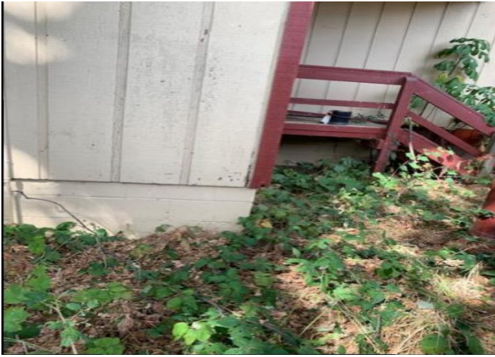
3A 3F 3G